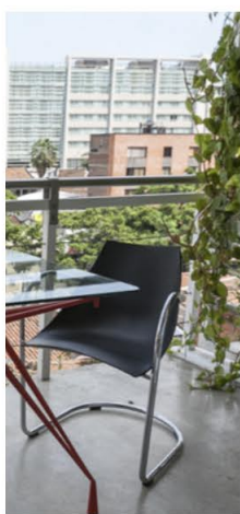
I can have your breakfast.