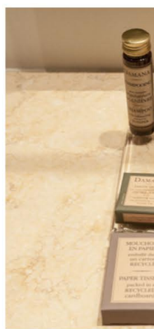
You can bet all of these D