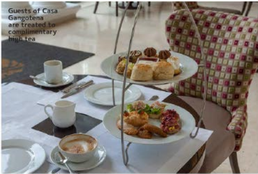
Guests of Casa Gangotena are treated to complimentary high tea