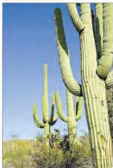
Saguaro National Park in Arizona.

It took some digging, but I've discovered that many must-see parks from coast to coast have alternative gateway towns, some with new, convenient and pleasant places to stay. Turn to G6 for my recommendations.