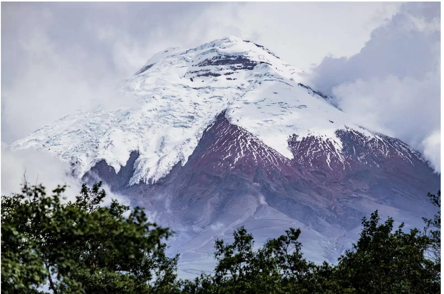
The Cotopaxi volcano, which is located outside of Quito.