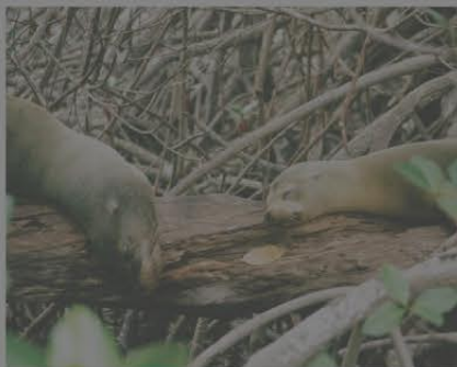
▲ Galápagos sea lions napping among the mangroves.

The ship claims to have the islands' highest guide- and Zodiac-to-guest ratios. Led by Silversea's expert naturalists, almost all of whom are Galapagueños, we saw the iguanas that inspired the 1998 Hollywood remake of Godzilla ; climbed into collapsed calderas that looked like the